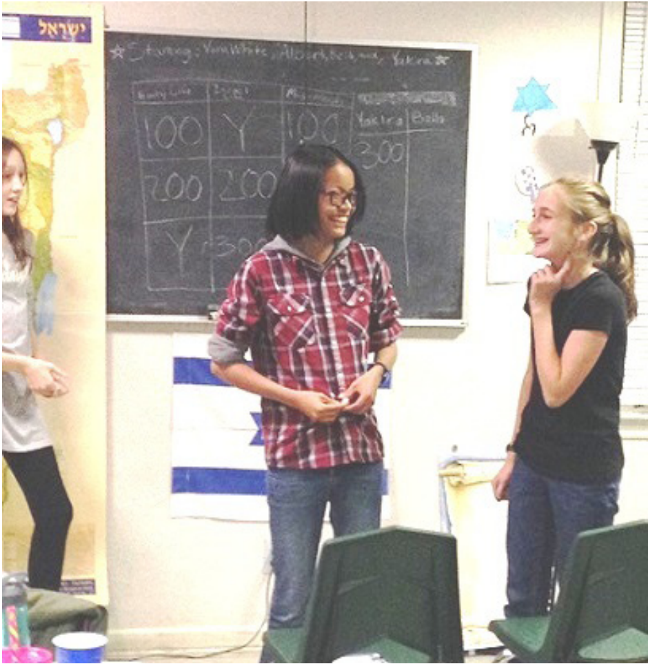
Above: Zayin students acting out a skit in class.