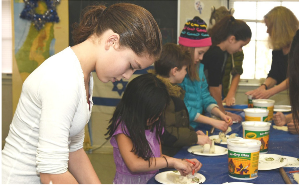
Celebrating in class...