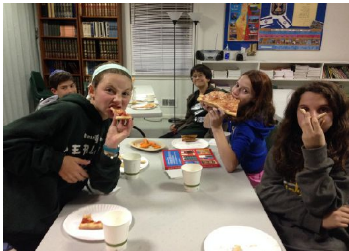
Seventh graders acting silly as they enjoy pizza during their weekly Thursday night study