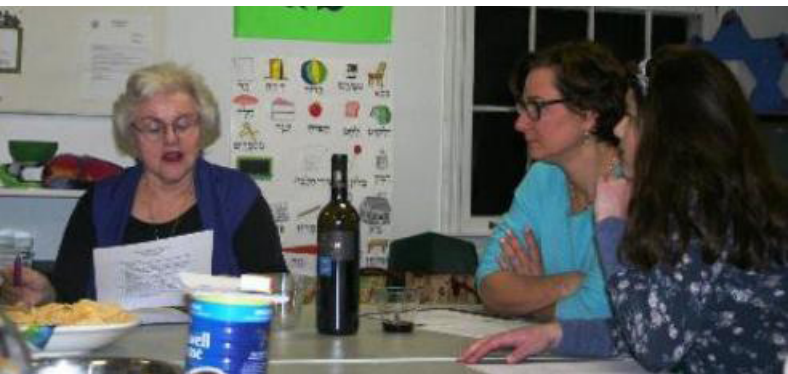
Rosh Chodesh Nisan gathering