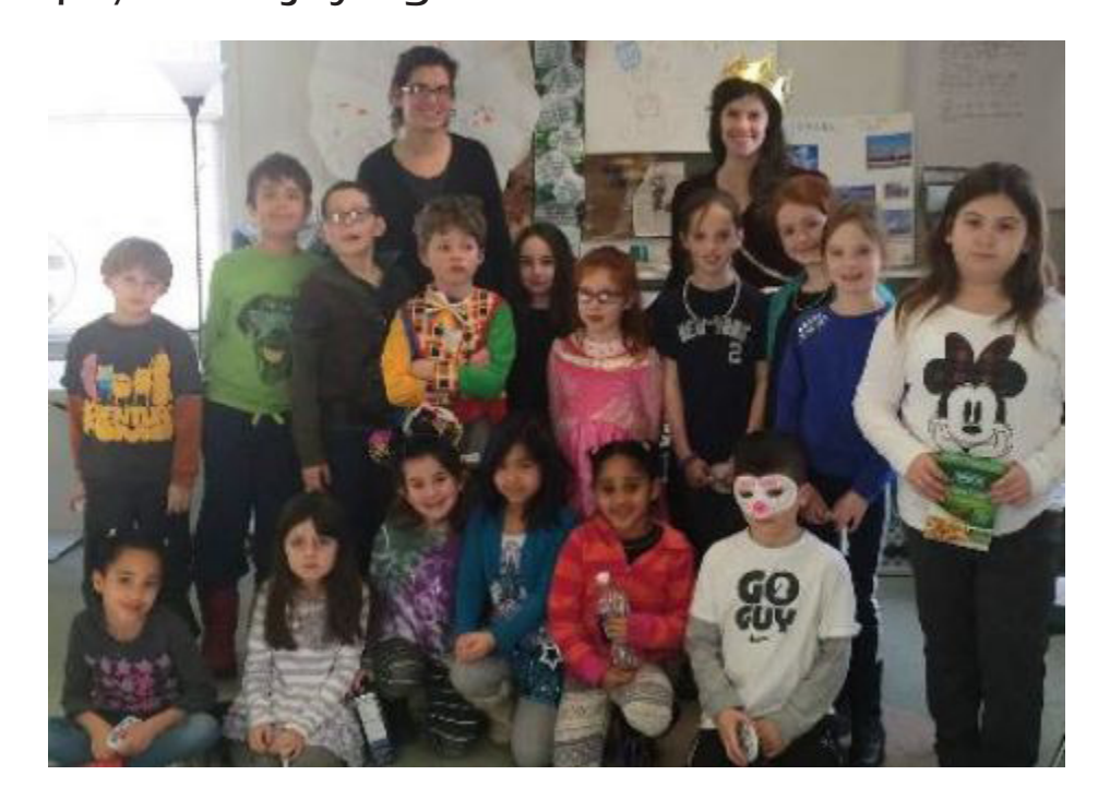
and practicing for Passover at their model seder.