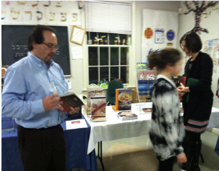
People browsing through the Book Fair selections