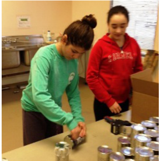
Sixth graders volunteering at the Food Bank for Westchester