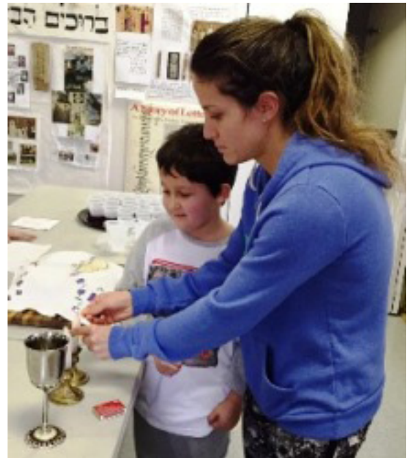
Kitah Aleph, Bet and Gimel families celebrating Shabbat with us at Hebrew School