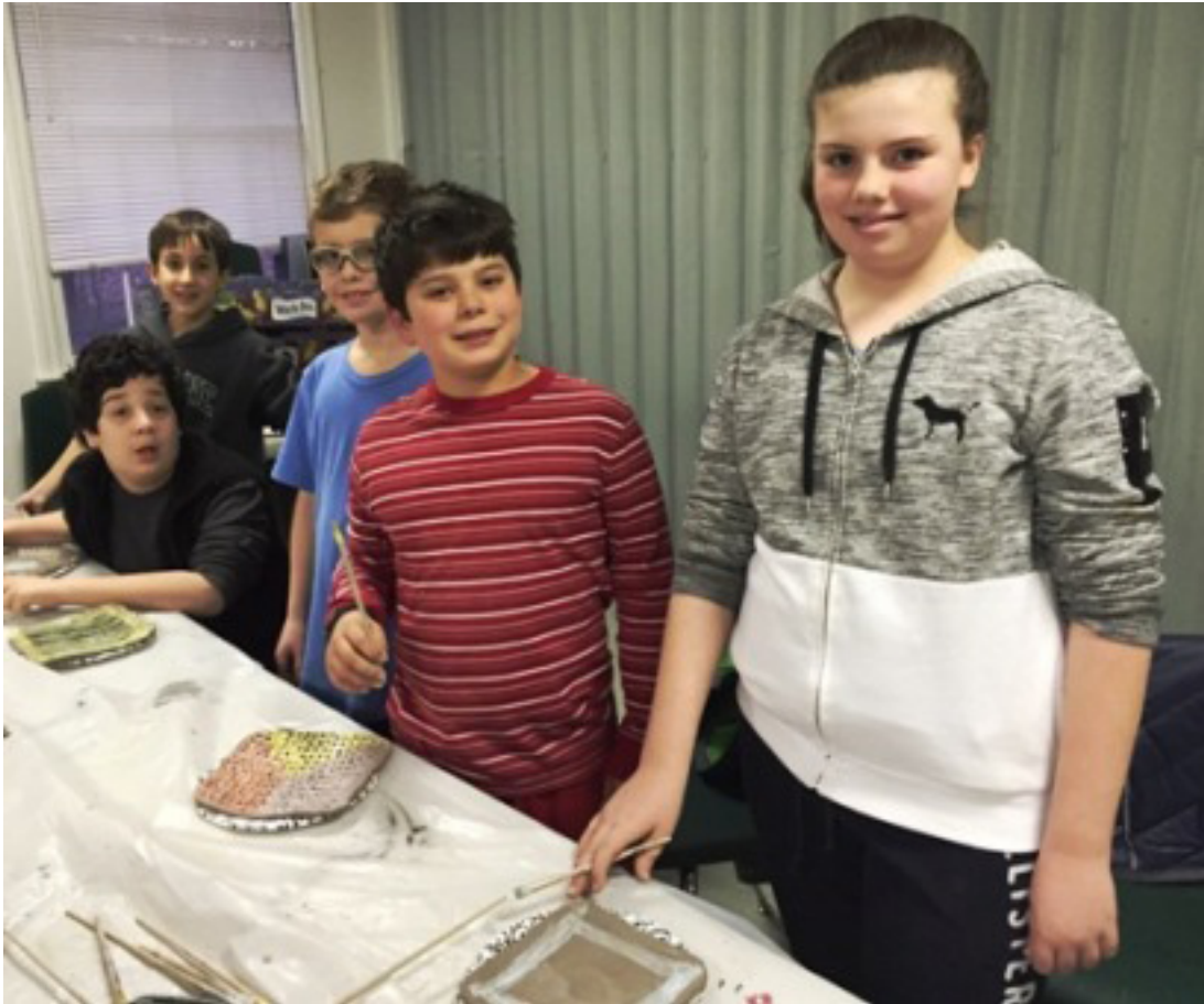
Kitah Hey students making clay plates for Havdallah ceremony