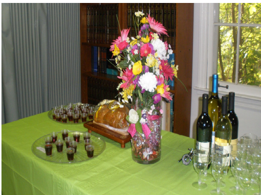
Table set for Challah Blessing