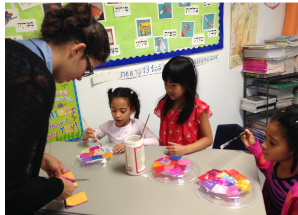
Alef/Bet students creating special plates for Rosh Hashanah