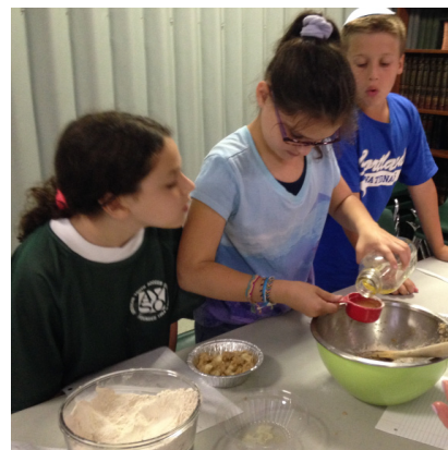
Daled students preparing the ingredients for an apple cake